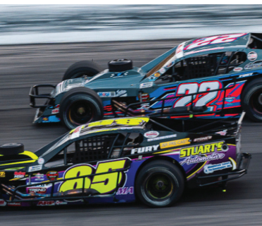
2. Thompson Speedway Motorsports Park 205 E. Thompson Road ThompsonSpeedway.com America's first purpose-built road course and asphalt high-banked oval. Also home to the Raceway Restaurant, Bogey's Ice Cream and Raceway Golf Club.