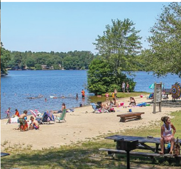
3. Quaddick State Park 818 Quaddick Town Farm Road portal.ct.gov/DEEP/State-Parks/Parks/Quaddick-State-Park