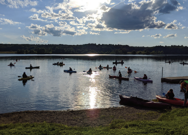
5. West Thompson Lake & Campground nae.usace.army.mil/Missions/Recreation/West-Thompson-Lake/ A USACE property featuring 24 campsites, disc golf and extensive hiking trails. Picnic sites and canoe launch are also available.