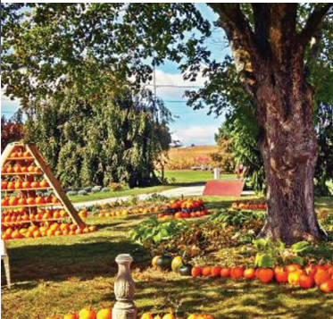
4. Fort Hill Farms & Gardens 260 Quaddick Road FortHillFarms.com Offering an annual corn maze, ice cream, lavender gardens, special events and more!