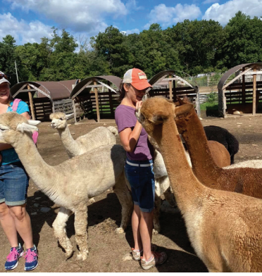
1. Morning Beckons Farm 343A Sand Dam Road MorningBeckonsFarm.com