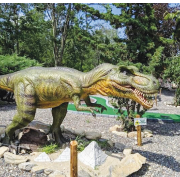
6. Tee Rex Mini-Golf 274 Riverside Drive Tee Rex is an 18 hole dinosaur-themed mini golf course. Group rates are available. Cool down with 25+ flavors of soft and hard serve ice cream before or after you play!